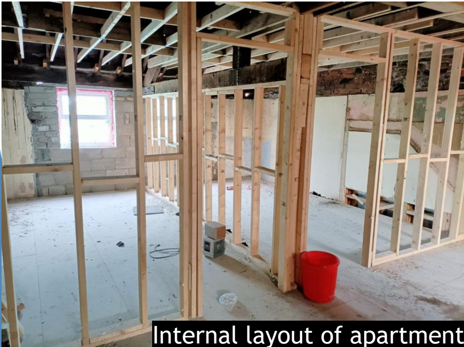
Internal layout of apartment