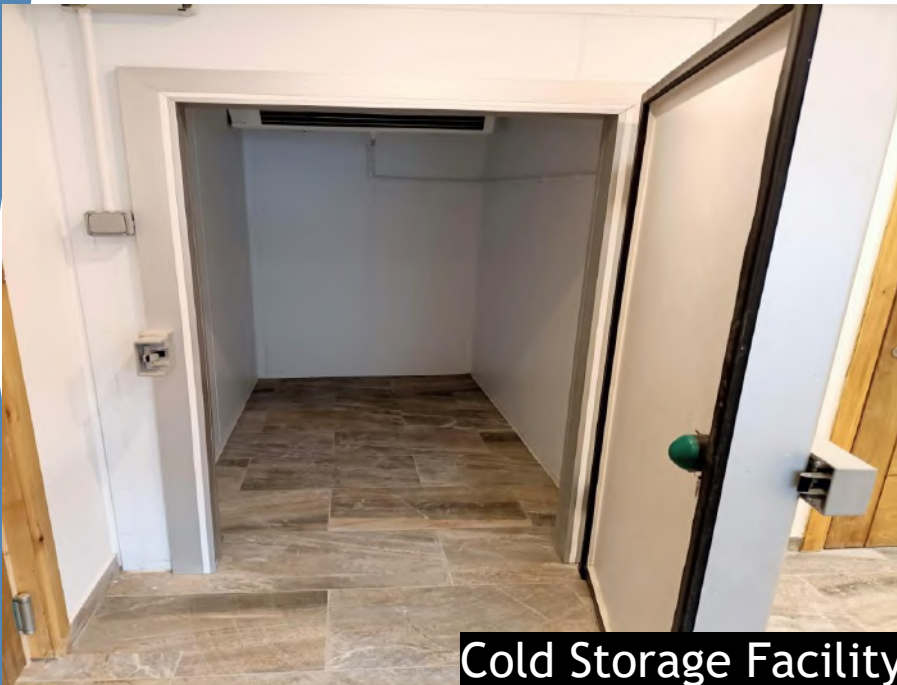
Cold Storage Facility