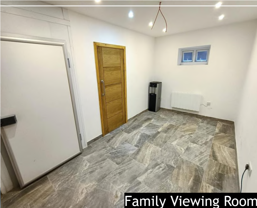
Family Viewing Room